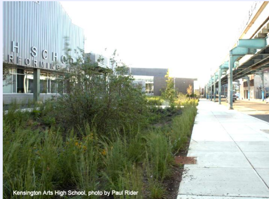
Kensington Arts High School